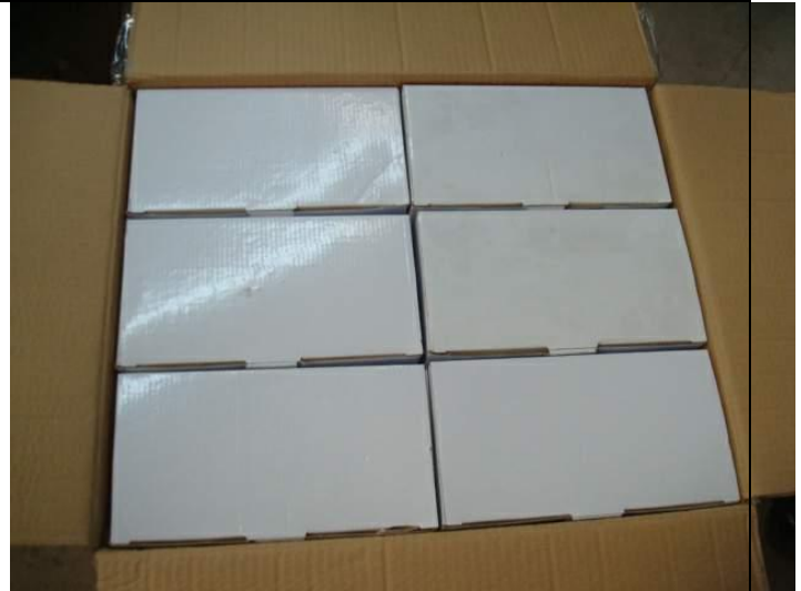
Brown box packing