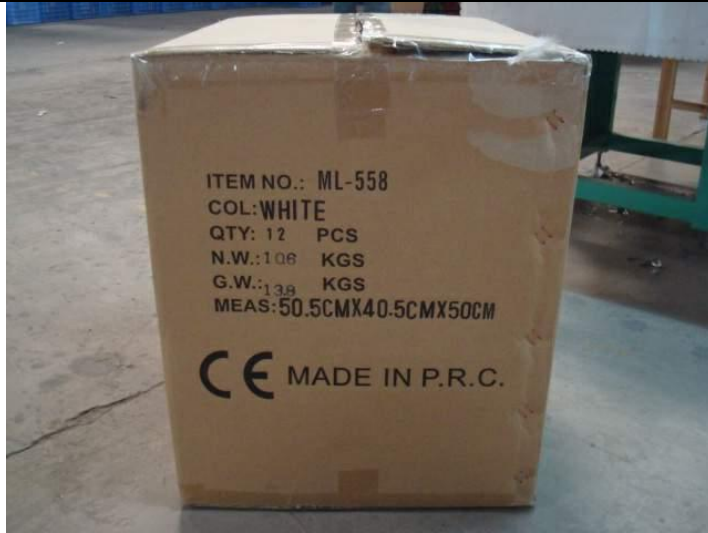
Label on brown box